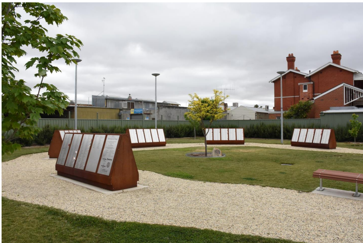
Telegraph Park Memorial