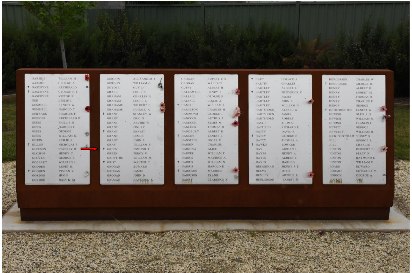
Telegraph Park Memorial